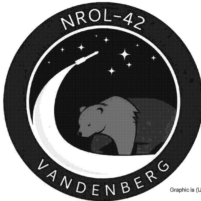
Graphic is (U)

(S//TK//REL) The Grizzly Bear logo will serve as both the OSL "Mission Logo" and the "Space Vehicle Logo"