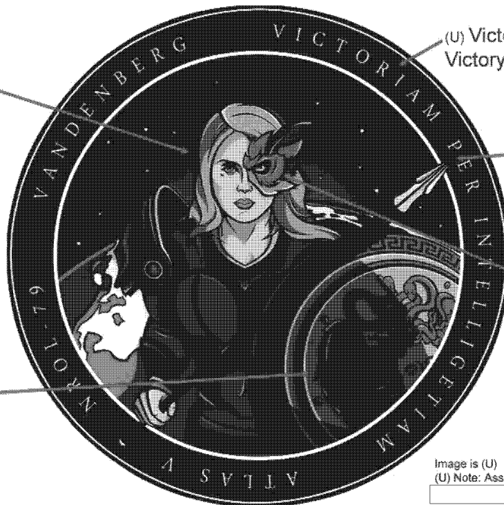
Image is (U) (U) Note: Association of the logo with [Redacted] is (S//TK//REL)

(U) Athena's shield depicted Medusa to terrify her opponents