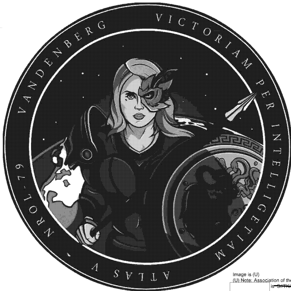
Image is (U) (U) Note: Association of the logo with [redacted] is SECRET//TK//REL