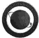
Figure 1: Proposed GEOINT Patch Conversion from Color to OCP