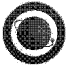
Figure 3: AFELM Guidance for OCP Patch Wear