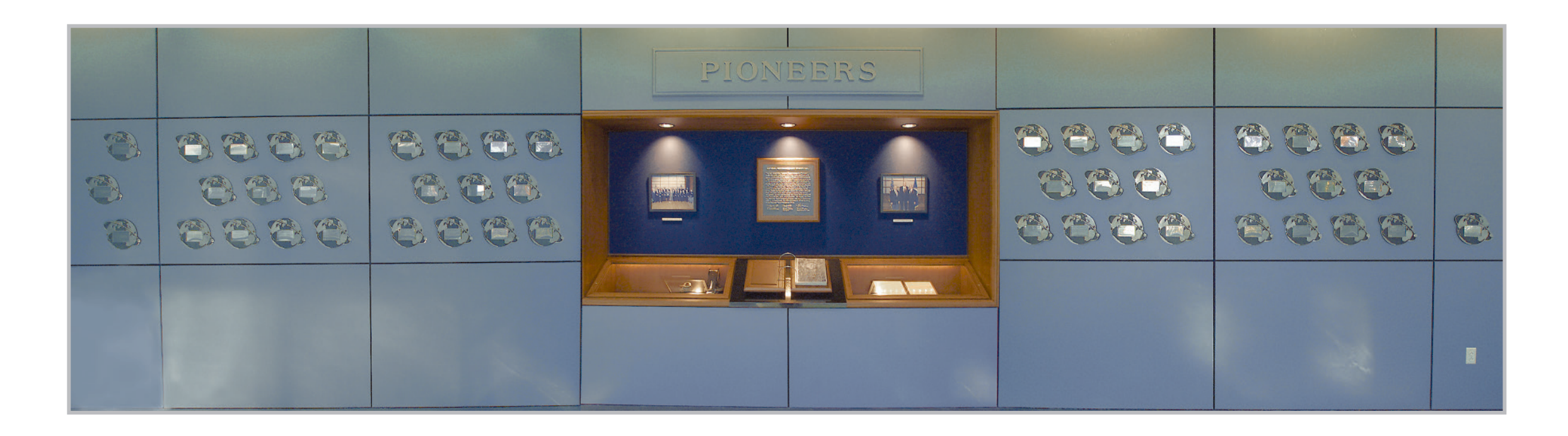
Pioneer Hall National Reconnaissance Office Chantilly, Virginia