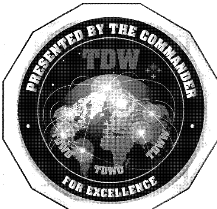
Back Of Coin