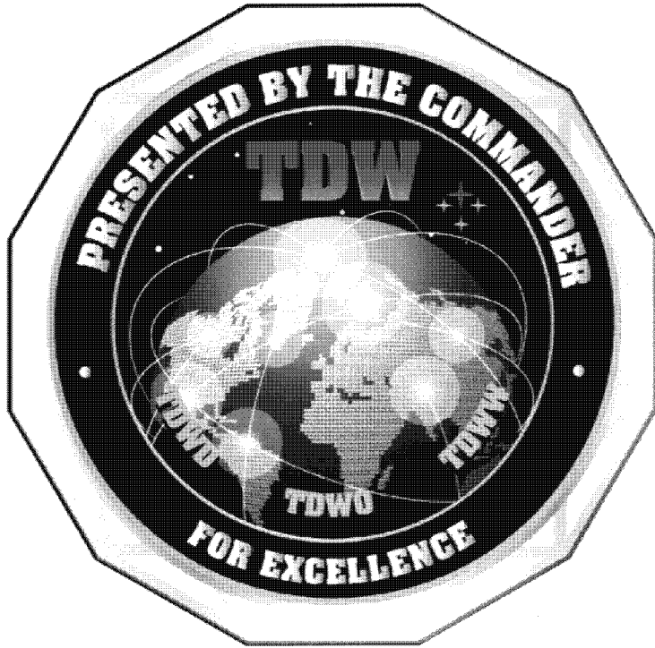
Back Of Coin