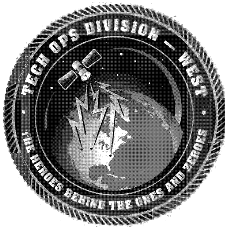
Front Of Coin