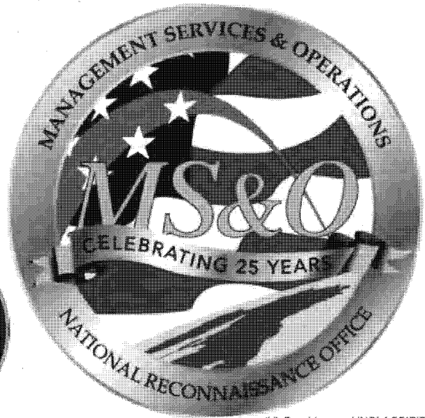
(U) Graphics are UNCLASSIFIED