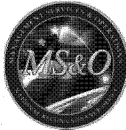
(U) Current MS&O Logo