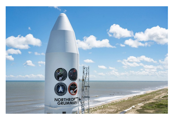
NROL-129 launches out of NASA's Wallops Flight Facility, Virginia, on July 15, 2020.

dedicated launch out of NASA's Wallops Flight Facility in Virginia. NROL-129 carried a classified payload designed, built and operated by the NRO, and it launched aboard a Northrop Grumman Minotaur IV rocket.