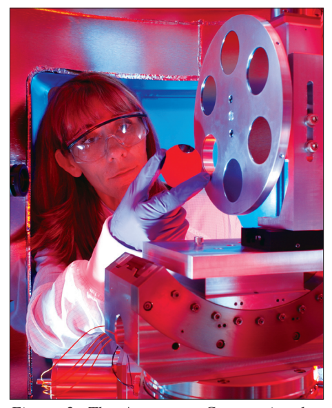
Figure 2. The Aerospace Corporation has a long history of developing tools, models, data, analysis, and testing capabilities to support mission assurance for both the Air Force and National Reconnaissance Office.

tor. Once spaceflight worthiness certification is made, the mission director is responsible for ensuring that flight worthiness is maintained all the way through the remaining operations, including countdown and launch. The mission director, under SMC authority for Air Force payloads and NRO authority for NRO payloads, is the overall mission team lead in establishing the focus for mission assurance and mission success.