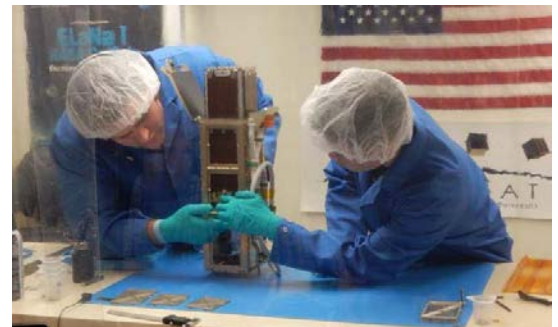
Researchers work on the USS Langley, a U.S. Naval CubeSat that was launched aboard the U.S. Air Force AFSPC-5 mission in May 2015, from Cape Canaveral Air Force Station.

The NRO is committed to innovative, mission-driven space acquisitions that ensure our systems – from large to small – continue delivering invaluable intelligence for the nation. CubeSats are uniquely qualified to support this goal by providing more frequent on-orbit opportunities to demonstrate, apply, and mature technologies that help our nation's leaders and policymakers stay ahead of emerging threats to the national security mission.